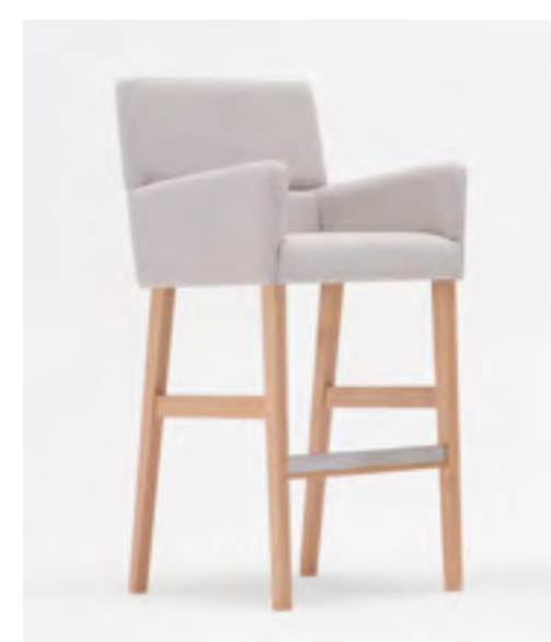
H-ZAP BEECH/OAK H 118 W 60 D 56 SH 78 AH 98