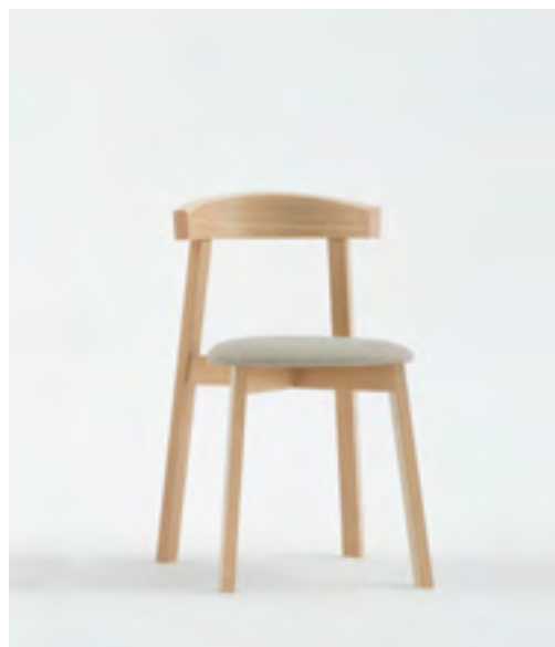
A-2920 BEECH/OAK H 77 W 45 D 51 SH 48