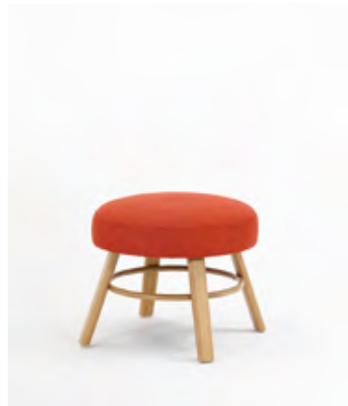
C-2220 BEECH/OAK H 48 W 67