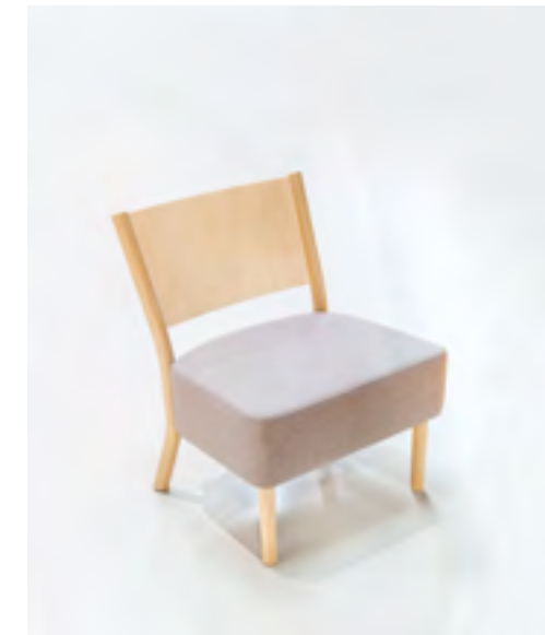
M-4480 BEECH/OAK H 71 W 70 D 57,5 SH 40