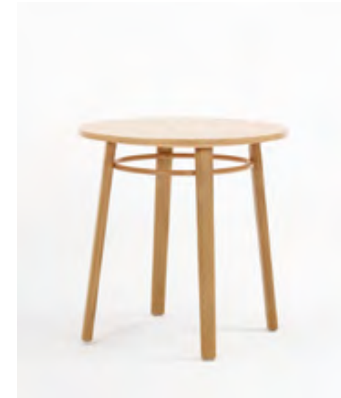
S-2220 BEECH/OAK H 74 W 75