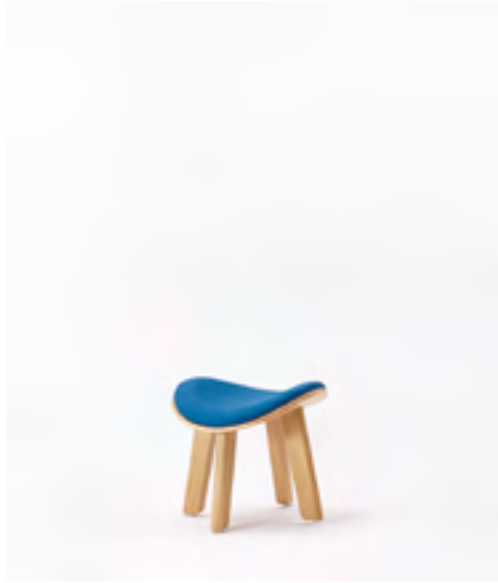
U-DUB OAK H 29 W 34,5 D 32