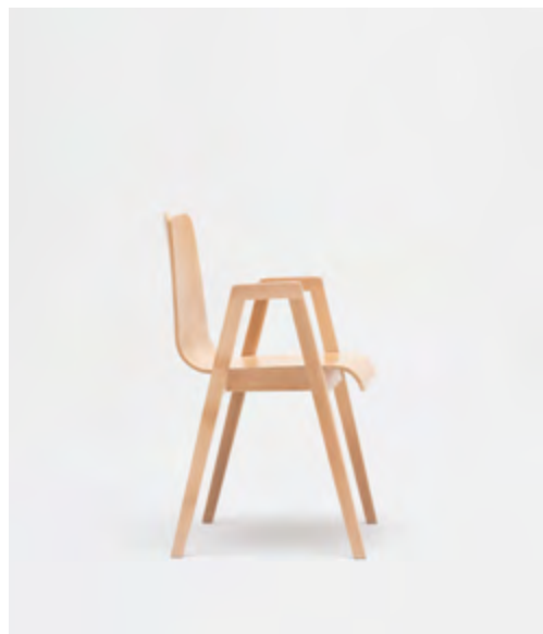
B-2120 BEECH H 85 W 48 D 53 SH 46