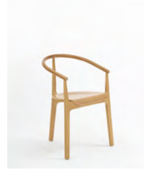
B-2940 OAK H 77,5 W 58 D 54 SH 46 AH 64