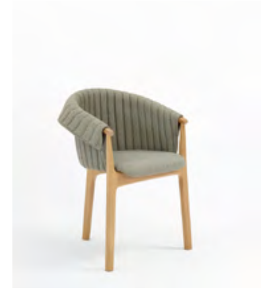
B-2945 OAK H 79 W 60 D 56 SH 50 AH 64