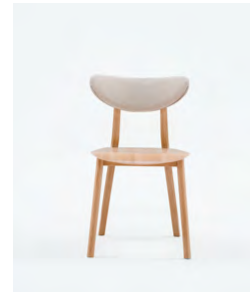
A-4235 BEECH/OAK A-4230 (VB) BEECH/OAK H 81,5 W 48,5 D 54,5 SH 46