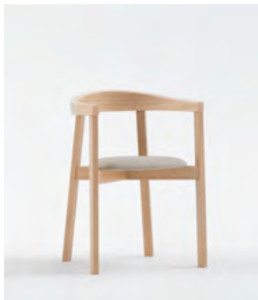
B-2920 BEECH/OAK H 77 W 53 D 53 SH 48