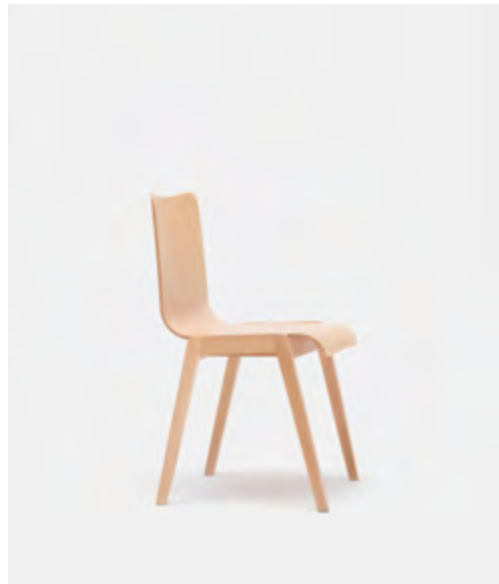
A-2120 BEECH H 84 W 50 D 54 SH 46