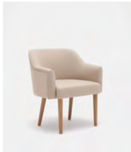
B-FUM 1 BEECH/OAK H 81 W 71,5 D 67 SH 46,5