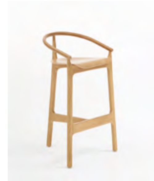
H-2940 OAK H 95 W 57 D 56 SH 76 AH 82