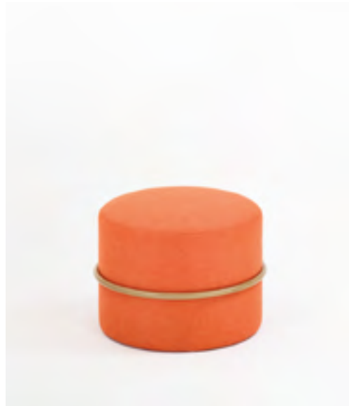
C-2225 BEECH H 48 W 62