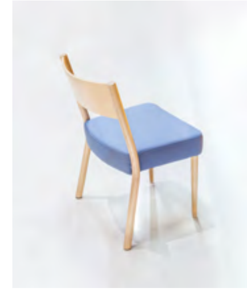
A-4480 BEECH/OAK H 81,5 W 52 D 52,5 SH 46