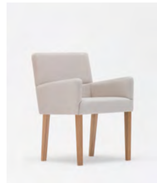
B-ZAP 1 BEECH/OAK H 84,5 W 60 D 56 SH 45 AH 65