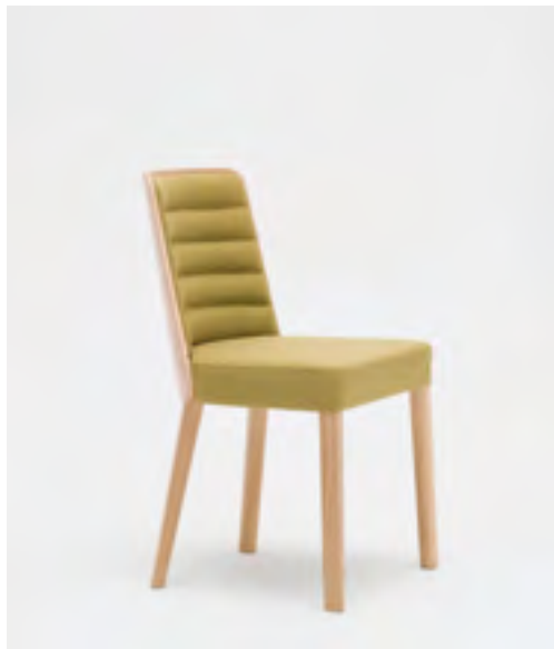
A-5035 BEECH/OAK H 85 W 47,5 D 53,5 SH 48