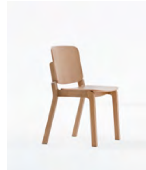
A-3701 BEECH/OAK H 80 W 49,5 D 51,5 SH 46