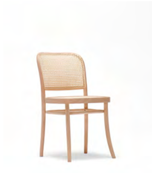
A-8120 BEECH H 80,5 W 44,5 D 54 SH 46