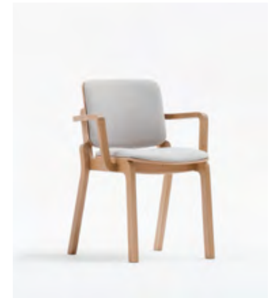
B-3702 BEECH/OAK H 80 W 49,5 D 51,5 SH 46 AH 66