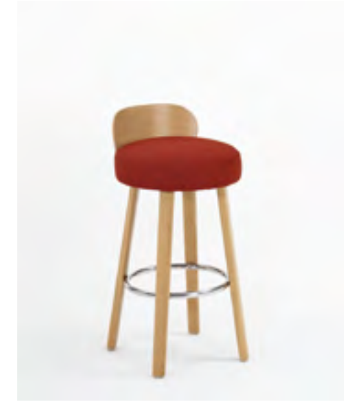
H-2220 BEECH/OAK H 83,5 W 44 D 46,5 SH 75