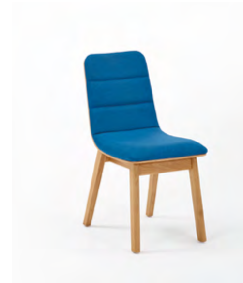
A-DUB OAK H 90 W 45 D 60 SH 47