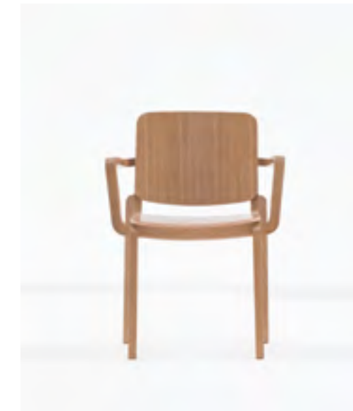
B-3701 BEECH/OAK H 80 W 49,5 D 51,5 SH 46