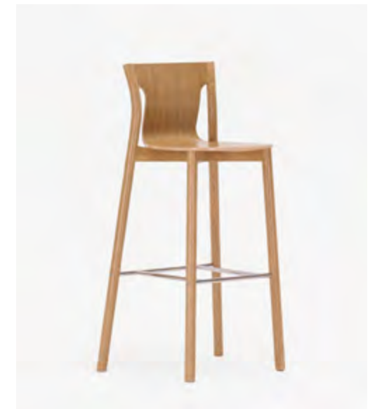
H-2160 BEECH/OAK H 106 W 56,5 D 45,5 SH 79