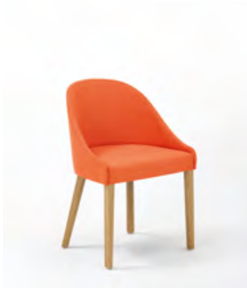
B-5005 OAK H 80,5 W 55,5 D 54 SH 48