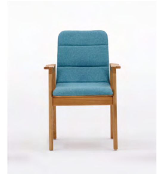
B-DUB OAK H 90 W 62 D 62 SH 47 AH 64,5