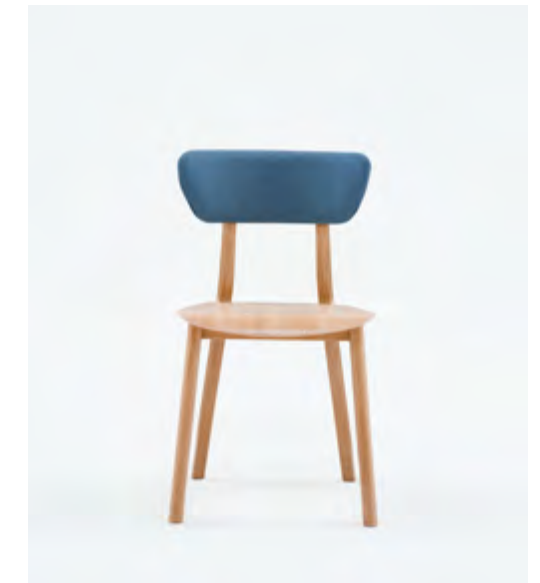
A-4236 BEECH/OAK A-4231 (VB) BEECH/OAK H 81,5 W 48,5 D 54,5 SH 46