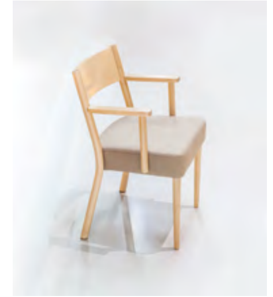
B-4480 BEECH/OAK H 81,5 W 56 D 53 SH 46 AH 67