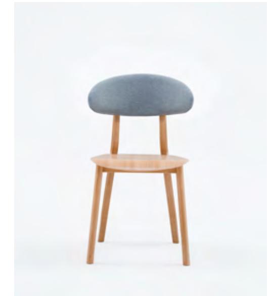
A-4237 BEECH/OAK H 81,5 W 48,5 D 54,5 SH 46