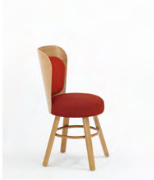
A-2220 BEECH/OAK H 98 W 44 D 52 SH 51