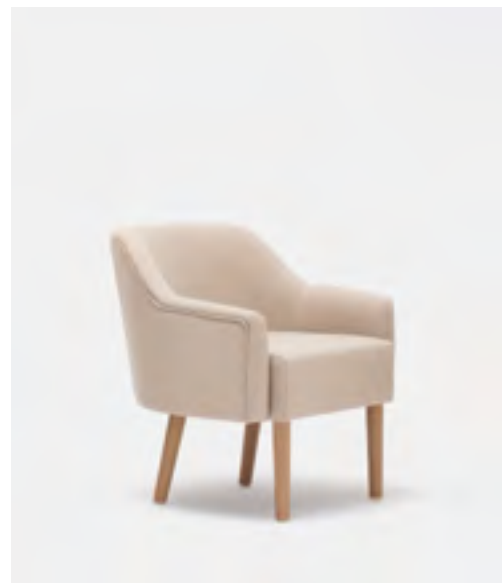
M-FUM BEECH/OAK H 69 W 71,5 D 67 SH 40