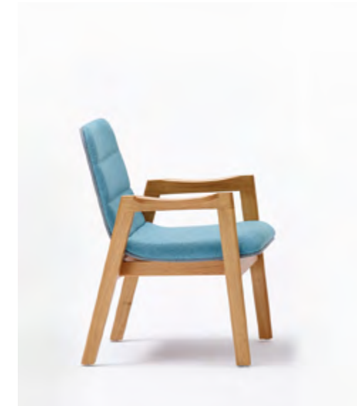
M-DUB OAK H 78 W 62 D 62 SH 42 AH 56