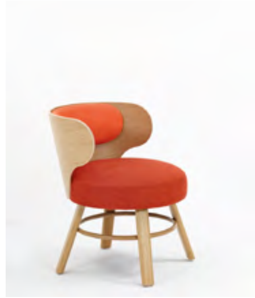
B-2220 BEECH/OAK H 73 W 58,5 D 67 SH 48