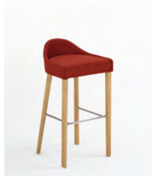
H-5005 OAK H 88,5 W 48 D 46 SH 76