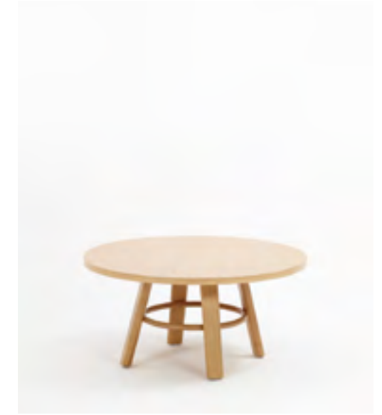
S-2221 BEECH/OAK H 35 W 75