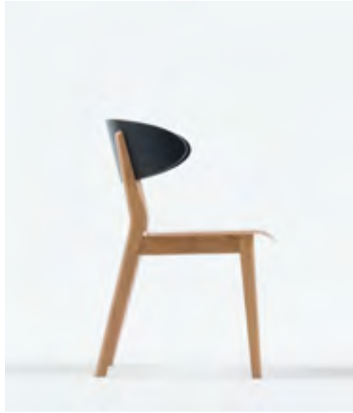
A-4224 BEECH/OAK A-4229 (UPH) BEECH/OAK H 78,5 W 52,5 D 54 SH 44