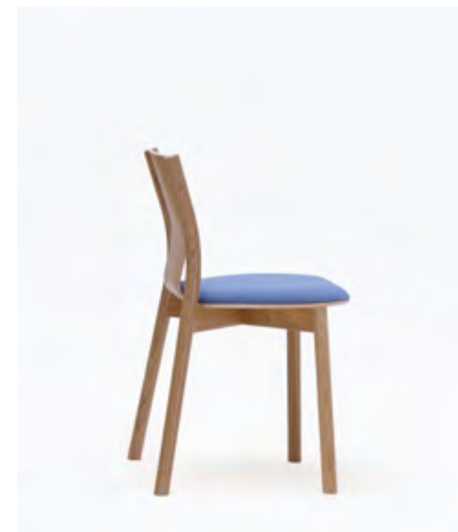
A-2160 (UPH) BEECH/OAK H 79,5 W 55 D 49 SH 48