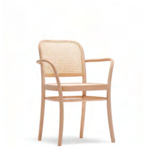
B-8120 BEECH H 80,5 W 61,5 D 53 SH 46 AH 66