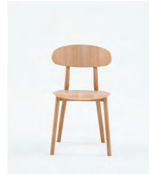
A-4232 BEECH/OAK H 81,5 W 48,5 D 54,5 SH 46