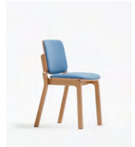
A-3702 BEECH/OAK H 80 W 49,5 D 51,5 SH 46