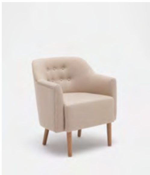
B-FUM 2 BEECH/OAK H 81 W 71,5 D 67 SH 46,5