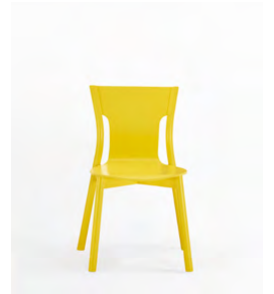
A-2160 BEECH/OAK H 81,5 W 55 D 49 SH 46