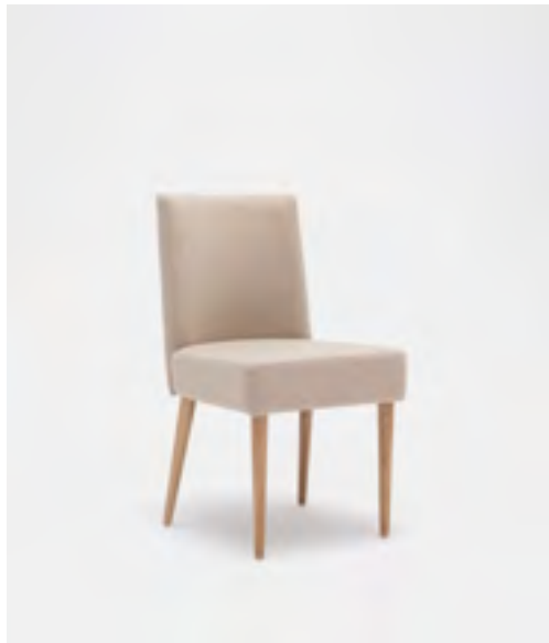
A-FUM BEECH/OAK H 84 W 47 D 53 SH 46,5