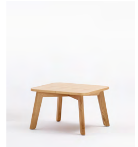
COFFEE TABLE-DUB OAK H 38 W 60 D 60