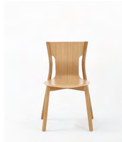
A-2160 BEECH/OAK H 81,5 W 55 D 49 SH 46