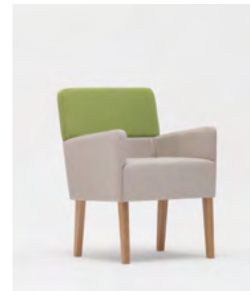
B-ZAP 2 BEECH/OAK H 85 W 60 D 56 SH 45 AH 65