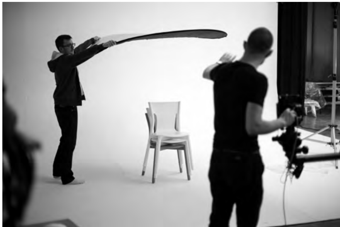
FOT. ERNEST WIŃCZYK

MARCH 17TH, 2014 JAKUB CERTOWICZ PHOTO STUDIO, WARSAW