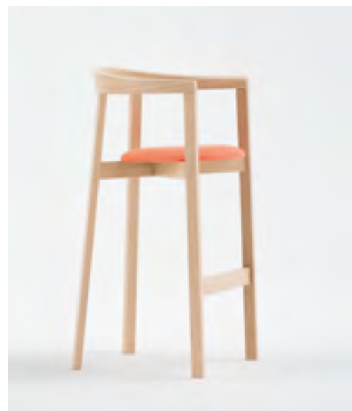
H-2920 BEECH/OAK H 108 W 53 D 56 SH 79